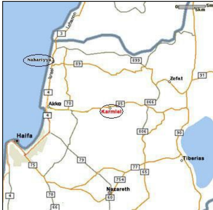
Fig. 2 – Israel's northern district